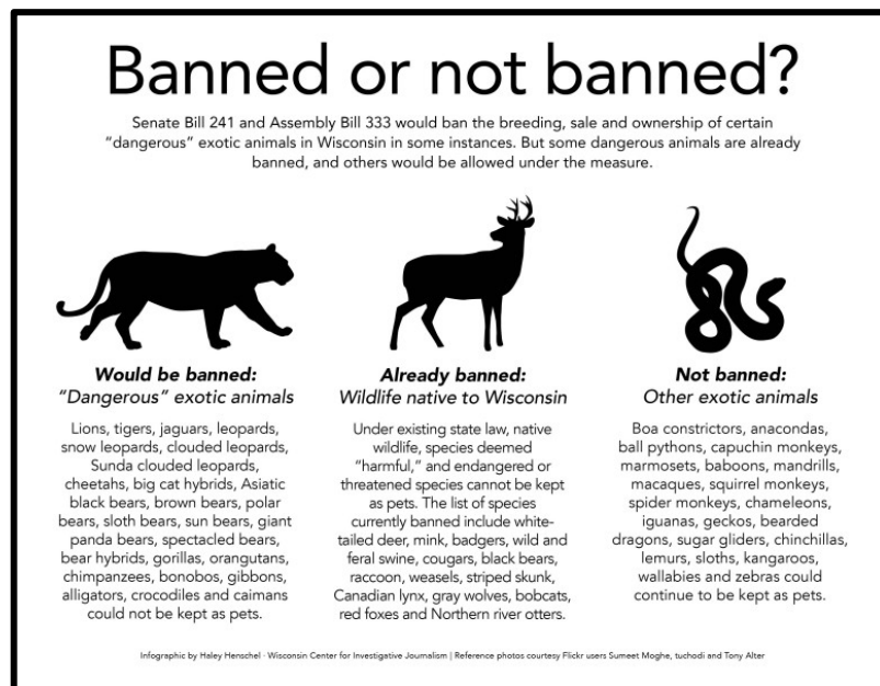
Figure 3: Species Banned or Not Banned in Senate Bill 241 171

apes, and crocodilians.” 165 The bill required insurance and care regulations similar to Ohio’s law. 166 It also grandparented in current pet owners and provided financial penalties for owners whose animal attacked someone or caused property damage. 167 While many organizations supported the bill, others said it did not go far enough to protect popular exotic pet species. 168 The Zoological Association of America (ZAA) opposed the bill because it said that there were no important differences in the bill’s language regarding animal welfare and public safety concerns. 169 The ZAA also cited the lengthy exemption list of permitted exotic pets and stressed that the bill’s current form will not likely achieve what lawmakers intend. Figure three below illustrates what species the law would outright ban and not ban. 170