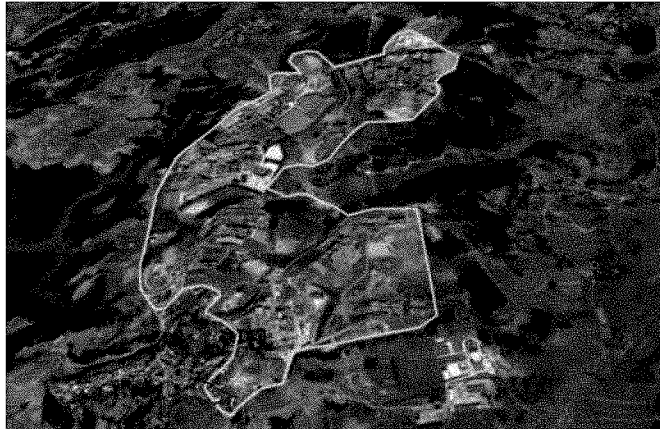
Student clinicians at EBLC mapped Dongxishao Industry Park and its surrounding villages using the Google Earth application.

Another example of an environmental problem discovered through this innovative approach is the Dongxishao Phosphorus Industry Park pollution problem near the Fuxian Lake. 53 Through the site visits and interviews with local residents, the clinic discovered that a wastewater treatment plant in the Dongxishao Phosphorus Industry Park had not obtained “inspection approval” to verify that it had complied with the “three simultaneous” requirements. 54 These requirements are that construction projects must be designed, constructed, and operated simultaneously with the design, construction, and operation of waste treatment facilities. 55 The residents believed that the plant had been discharging wastewater collected from facilities in the park into Fuxian Lake without proper treatment. 56 In addition, local residents reported that the facilities in the park did not have proper environmental and safety measures in place to protect workers and residents from exposure to yellow phosphorus, a major raw material processed by the facilities that is listed as a hazardous chemical in China. 57